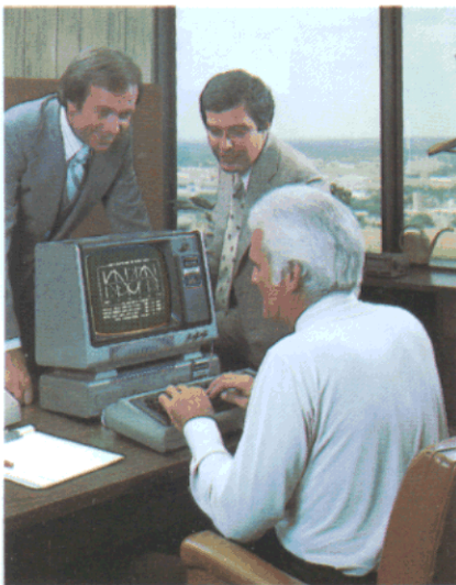
Businesses of all sizes can computerize various operations with TRS-80, the low-cost, expandable microcomputer from Radio Shack!